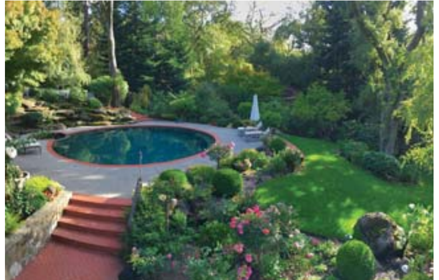
A beautiful Orinda garden with a pool