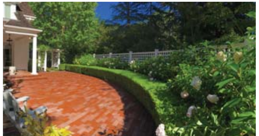
An elegant side garden on the tour.

For more information and tickets visit www.orindagc.org/tour2017 .